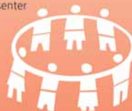
people and places